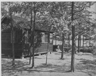
Camp Shelter—Lake Absegami

The forest is within easy driving distance of southern New Jersey seashore resorts and excellent bay fishing.