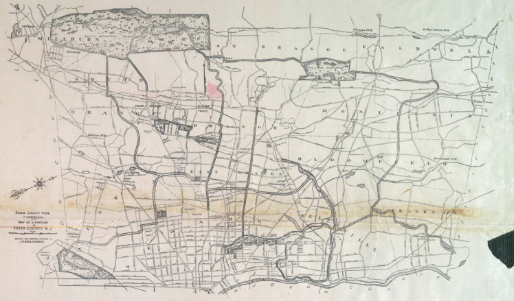
GENERAL MAP OF THE ENTIRE IMPROVEMENT.