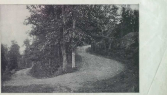
The Eagle Way—Eight Rock Reservation.