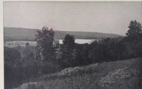
General View of Reservation from North East—South Mountain Reservation.

The lands have been bought, and it was required for the purpose of the park to be developed. The lands to be taken will be developed and continuing to build up the park property, or transfer, for the purpose of the park to be developed. The lands to be taken will be developed and continuing to build up the park property, or transfer, for the purpose of the park to be developed.