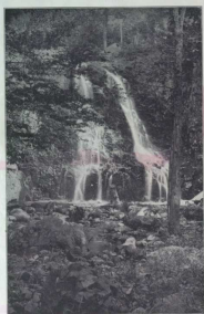
Headlock Falls—South Mountain Reservation.