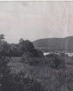
View Southwesterly from Northfield Road.