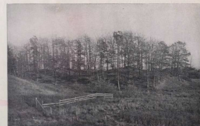
Wooded Knoll—Woodland Reservation.