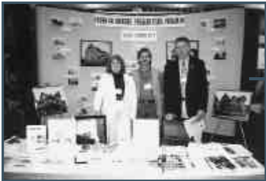
Members of the Evesham Township Historic Preservation Commission attend a CLG funded information booth at the Annual NJ League of Municipalities conference.