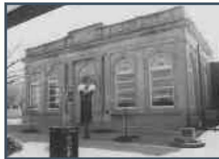
MARINE NATIONAL BANK, WILDWOOD CITY