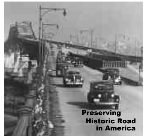
Preserving Historic Road in America

The 3rd biennial Preserving the Historic Road in America conference will be held in Omaha, Nebraska in April 2002. Like its predecessors in Los Angeles, CA (1998) and Morristown, NJ (2000), it promises to be an energetic and engaging meeting.