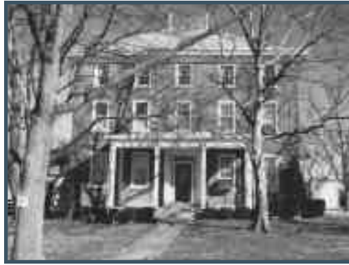
The Hackett house in Mannington Township, Salem County, now protected under preservation easement.