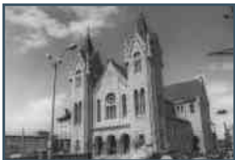
ST. NICHOLAS OF TOLENTINE CHURCH, ATLANTIC CITY