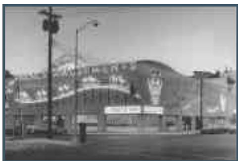
PALACE AMUSEMENTS, ASBURY PARK