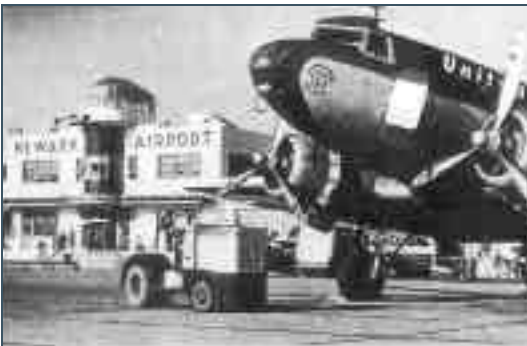
Historic Photo - Newark Airport

In 1980 the Historic Preservation Office prepared a nomination for the early buildings of Newark Airport, including the 1935 Airport Administration Building (now called Building 51). When Building 51 was completed, Newark Airport was arguably the most important airport in the world. The ribbon cutting ceremony was attended by Amelia