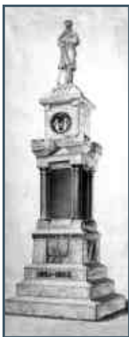
Rendering of Newton's Civil War Monument, erected in 1895. Illustration courtesy of Wayne McCabe.