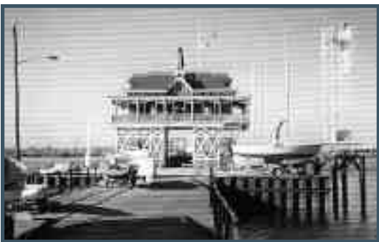
The rehabilitation of the failing below water level bulkhead of the Riverton Steamboat Landing, Riverton Borough, Burlington County, threatened by deterioration and erosion, will ensure the preservation the above water level facility.

On February 2, 2000, NJDOT Commissioner James Weinstein announced the award of $12 million in transportation enhancement projects, for thirty five projects statewide, funded through the federal Transportation Equity Act for the 21st Century (TEA-21). Consistent with the TEA-21 vision that transportation initiatives respect the natural and built environment characteristics of our communities, transportation enhancements include such non-traditional transportation projects as creation of bicycle and pedestrian paths and trails; rehabilitation of historic canals and railroad stations; rehabilitation of transportation related buildings such as lighthouses, taverns, inns, and transportation manufacturing facilities; and improvements to downtown streetscapes.