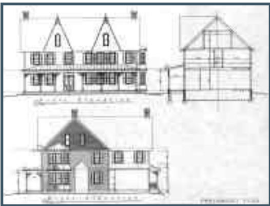
Berlin Hotel Berlin Borough, Camden County, a former hotel/stage coach stop will be rehabilitated for public community use as an annex to the Berlin Public Library.