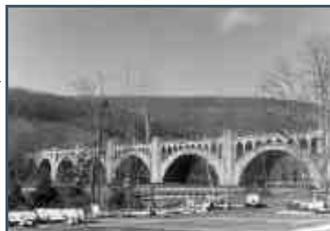
The reinforced concrete open spandrel arch bridge across the Delaware River between NJ and Pa is a significant feature of the 28-mile long Delaware, Lackawanna, and Western Railroad New Jersey Cut-Off Historic District.

Future activities include identifying potential effects, avoidance/minimization alternatives, and (if appropriate) mitigation treatments where adverse effects may be unavoidable for a range of typical transportation project construction activities. Federal Transit Administration and New Jersey Transit staff will actively participate in the project during this coming year and the results of this project will be linked to ongoing project consultation with New Jersey Transit.