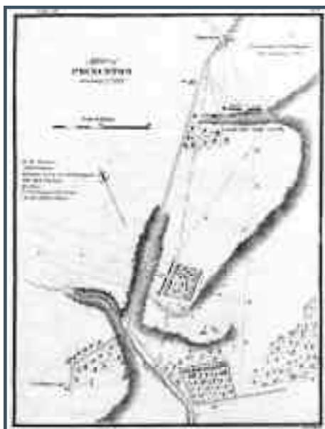
"Affair of PRINCETON" is an example of a visual primary document that will be implemented in the ABPP survey.

New Jersey has a vital commitment to insure a positive outcome of the ABPP within the state. During this past year the Historic Preservation Office has devoted