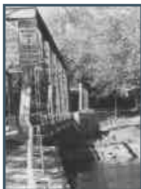
HIGGINSVILLE ROAD BRIDGES, HILLSBOROUGH TOWNSHIP