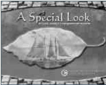
The NJDOT publication "A Special Look at New Jersey's Transportation System" includes many illustrations of projects involving historic bridges, railroad stations, maritime resources and historic and pre-historic archaeology.