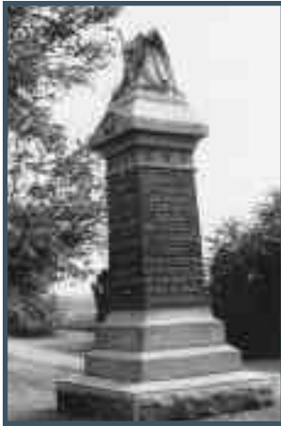
1st New Jersey Cavalry

sites consist of 21 battlefields and 23 associated historic properties. Productive research has commenced on several sites, which will be followed in upcoming months by site visits and field surveys. New Jersey, as an active participant of this federally-funded project, will benefit from the surveys as a valuable resource in future preservation and identification efforts of the State's Revolutionary War activities.