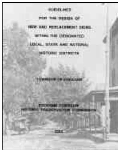
With CLG grant assistance Evesham Township developed a new sign ordinance and guidelines.