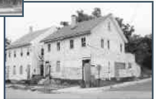
Typical of the houses in the Hedge-Carpenter-Thompson Historic District, these houses along with approximately 150 others, will be rehabilitated using the Investment Tax Credit.