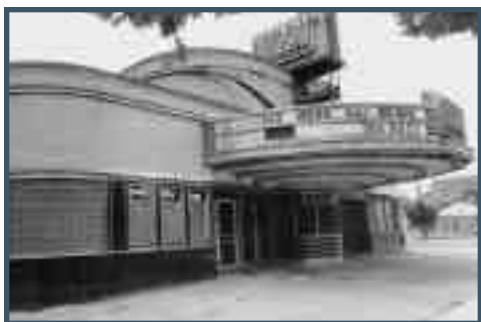
LANDIS THEATRE, VINELAND CITY