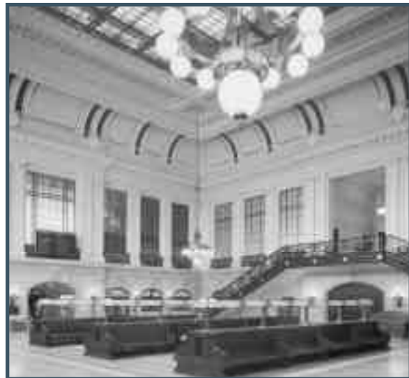
Erie-Lackawanna Terminal Main Waiting Room Hoboken 2000

Those treasures include 49 individual buildings in the New Jersey and National Registers of Historic Places, with an additional eight buildings determined eligible for listing. This fact makes NJ Transit the largest historic property owner of all transit agencies in this country. In the past six years, NJ Transit has spent $42.2 million restoring 14 station buildings and plans to spend another $59.1 million to continue work at Hoboken Terminal, Newark Penn Station and other stations. With NJ Transit's continuing support of preservation on the rails, we can all look forward to more remarkable restorations.