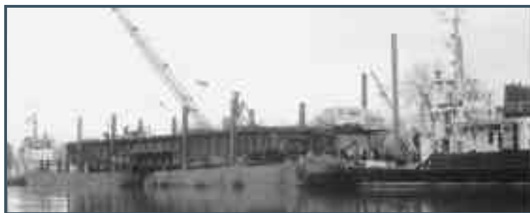
The Rancocas Creek bridge swing span being transported downstream on barges to its temporary storage site in Gloucester.

indicative of a generally positive group consultation effort between the HPO, and Transit and its prime contractor, Bechtel Infrastructure Corporation, that will continue throughout the project duration. Recent consultation has resulted in achieving significant mitigation milestones, such as the design of historically sensitive and evocative station stop platform canopies and furnishings, the inventory and proposed reuse of numerous historic railroad artifacts, and the incorporation of a concrete bridge repair color and texture matching program. Probably the greatest mitigation effort is NJT's attempt to market and relocate the largest bridge span within the project alignment - the steel multi-girder swing span crossing the Rancocas Creek between Riverside and Delanco.