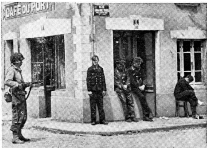
BEGINNING OF THE END — "D-Day," an hour-by-hour account of the Allied invasion of France on June 6, 1944, will be produced by David Wolper for NBC-TV's full-hour "Du Pont Show of the Week" Sunday. In this scene from Army Signal Corps film, an unidentified American GI (left) stands guard over four Nazis in the streets of Ste. Mere Eglise, Normandy.

A perpetual traveling trophy, the Martini & Rossi award will be on continual exhibit at various club houses of the American Power Boat Association throughout the United States. Annual winners will receive engraved plaques for permanent possession.