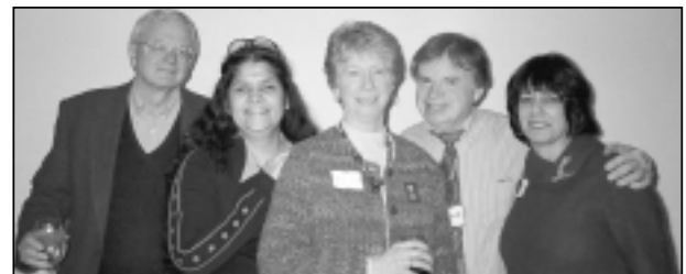
Some happy Club members at Appreciation Day