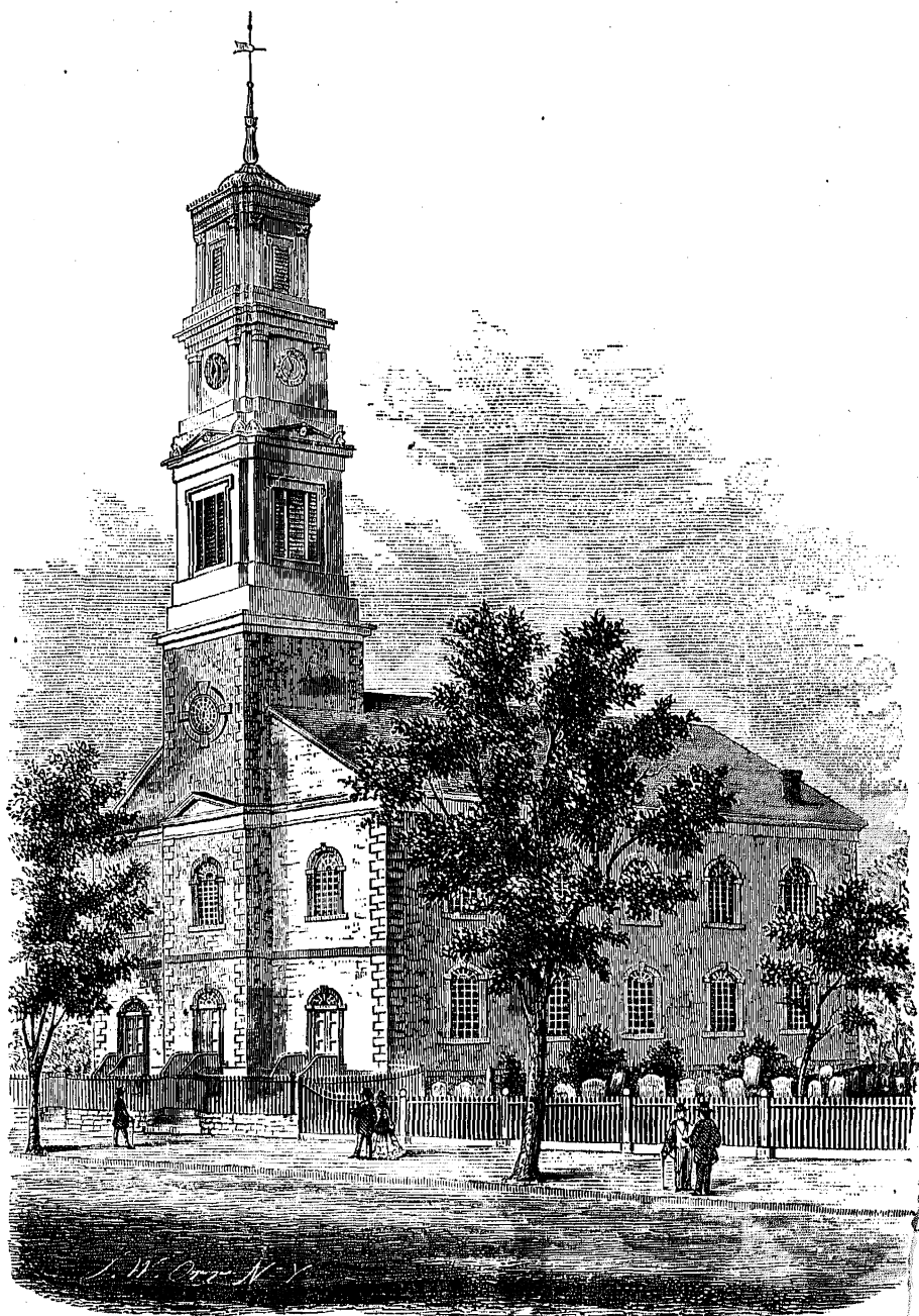
FIRST REFORMED DUTCH CHURCH, NEW-BRUNSWICK, N. J.