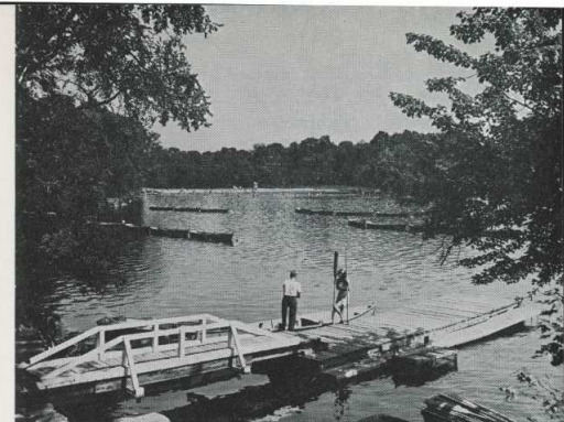
Boat dock at Swartswood Park

Row boats may be rented by those desiring this activity and also for fishing purposes. Small privately owned boats may be launched at a specific location subject to permit and payment of a nominal fee. Motorized craft, except those propelled by electricity, are not permitted on the lake.