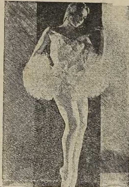
Yvette Chauvire in "Ballerina"

In "Moonlight Sonata," the Paderewski film now showing at the Garden, for a week's engagement, the great master plays, as only he can, four immortal classics, one of them being his own "Minuet in G Major."