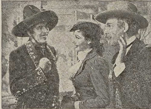
Warner Baxter, Lynn Bari, Henry Hull in "The Return of The Cisco Kid"