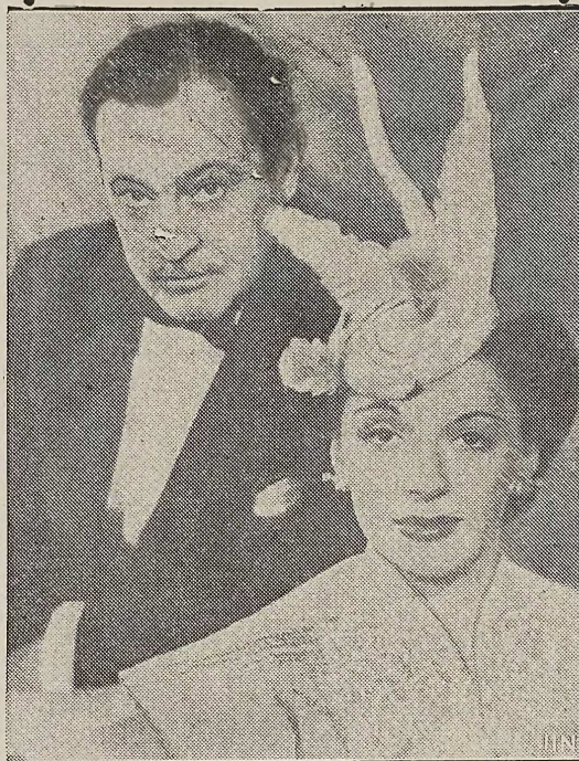
Mr. and Mrs. John Barrymore