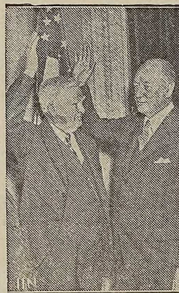
Vice President Garner Senator Slattery

Senator James M. Slattery of Illinois, right, appointed by Governor Henry Horner to complete the unexpired term of the late Senator J. Hamilton Lewis, is sworn in by Vice President Garner.