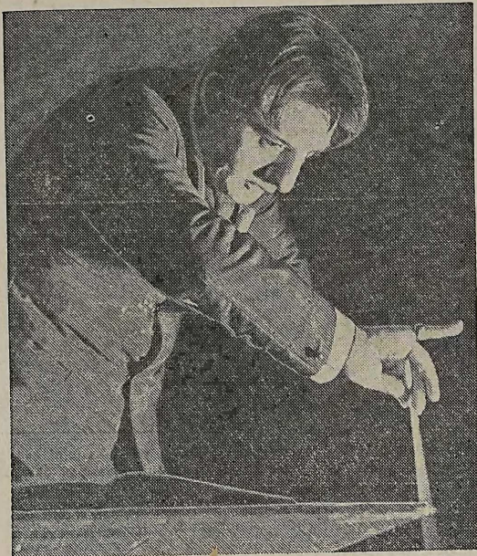
MASTER AT WORK —John Barbiroli, conductor of New York Philharmonic-Symphony Orchestra, was caught in this interesting bit of action as he rehearsed for the opening broadcast of the orchestra's tenth consecutive year on Columbia network Sunday, Oct. 15. No Barbiroli rehearsal scene would be correct that didn't find him in this high-buttoned black mohair jacket.