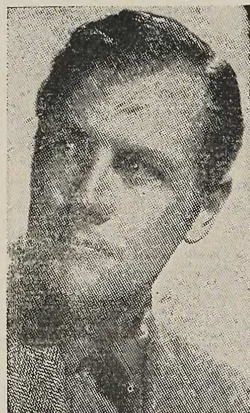
Joel McCrea in "They Shall Have Music."

With Jascha Heifetz, the World's most renowned violinist starred, Samuel Goldwyn's new major production, "They Shall Have Music," which will have its premiere showing at the