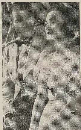
Gary Cooper and Andrea Leeds in "The Real Glory."

Lovely dark-tressed Andrea Leeds and six-foot he-man Gary Cooper provide the romantic interest in Samuel Goldwyn's "The Real Glory," the new adventure drama about the heroic exploits of the Philippine Scouts, which opens today at the Fa-