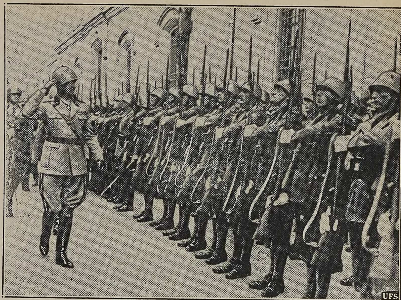
THEY'LL WAIT —Crown Prince Umberto, who has joint charge of Italy's army, reviews a regiment in Rome. When hostilities broke out, Mussolini declared that Italy would be neutral.

In many ways, the Community Symphony Orchestra is the "white hope" of cultural development in Paterson for it is one of the few city-wide enterprises of its kind now in existence. As such, it deserves the support of the entire community—now and in the future.