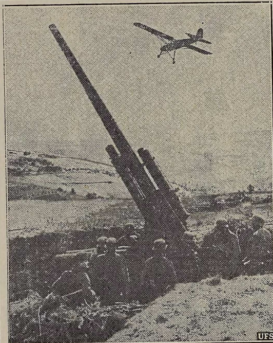
GUNS ARE LOADED —A German anti-aircraft gun on the fortified western border points ominously toward France. All Nazi fortifications were manned as Hitler ordered his troops to stand ready for a showdown.