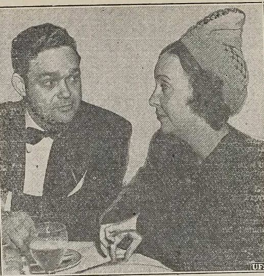
DINER-OUTERS —ZaSu Pitts, screen comedienne, appears most serious, as she dines with James Melton, screen singer, at New York's Waldorf-Astoria, but famous hands continue to flutter.