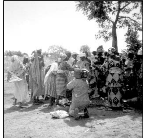
Mothers lead their daughters into the bush for cutting.

Currently there are two bills in Washington which can help Mali and other countries end poverty and improve healthcare. The Global Poverty Act (H.R. 1302) would direct the President and USAID to create and implement a comprehensive strategy to reduce poverty worldwide. Specifically, it would ensure that U.S. foreign policy