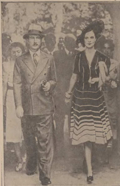
Ex-King Zog and former Queen Geraldine

Former King Zog of Albania and his wife, the former Queen Geraldine, are shown out for a stroll in Stockholm, Sweden, where they are living temporarily. The ex-queen is an American-born girl who recently became a mother.