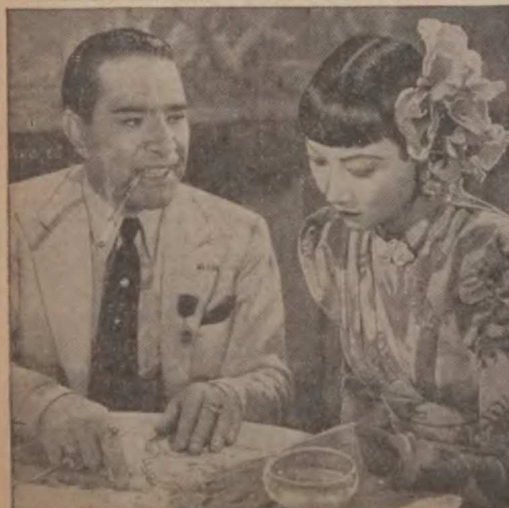
Anna M. Wong and J. Carroll Naish in "The Island of Lost Men"