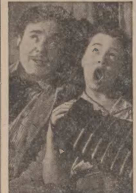
Leo Carrillo and Jane Withers in "Chicken Wagon Family"