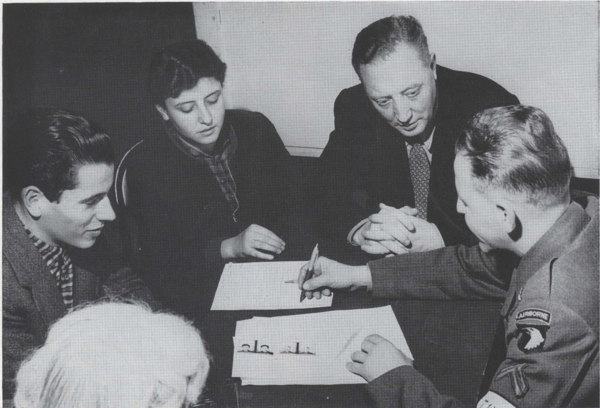
With the help of interpreters, the new arrivals were interviewed and processed.

the cabin and mingled with them. I thought it would be helpful in quieting their fears about flying. I also warned them that we Americans were a pretty enthusiastic bunch and some of us might even overdo our welcome to them once they landed in the United States."