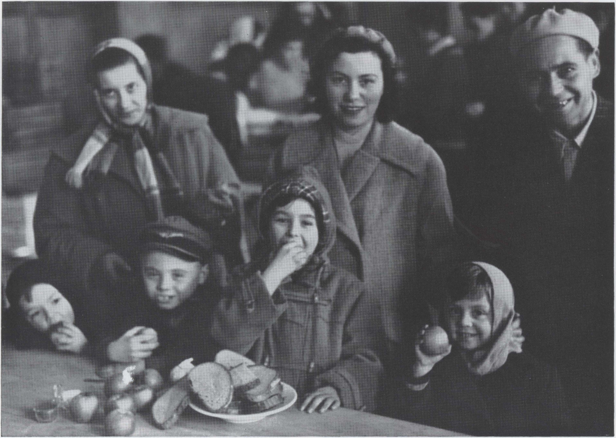
Breakfast in Austria consisted of brown bread, sausage, apples, and tea. Everywhere there were young people and children, the most likely victims of reprisal and deportation in the revolt's aftermath.

by an Austrian with a predilection for speed. He headed out through the western suburbs of Vienna and once he had reached the narrow, black-top road, winding through the flat farm country leading to Traiskirchen, his hot-rodding promptly brought police intervention. After he had been lectured sternly by an Austrian highway patrolman, we went on more sedately and came to the camp. It was a cluster of worn stone buildings that once had been a military school but now was in poor repair, with many cracked windows. There were a few trees around the grounds, but obviously it had been years since there had been any attempt at landscaping and most of the lawn had been scuffed away. Here and there, the refugees were walking about for exercise and a breath of fresh air; at no time did we see any children playing on the grounds.