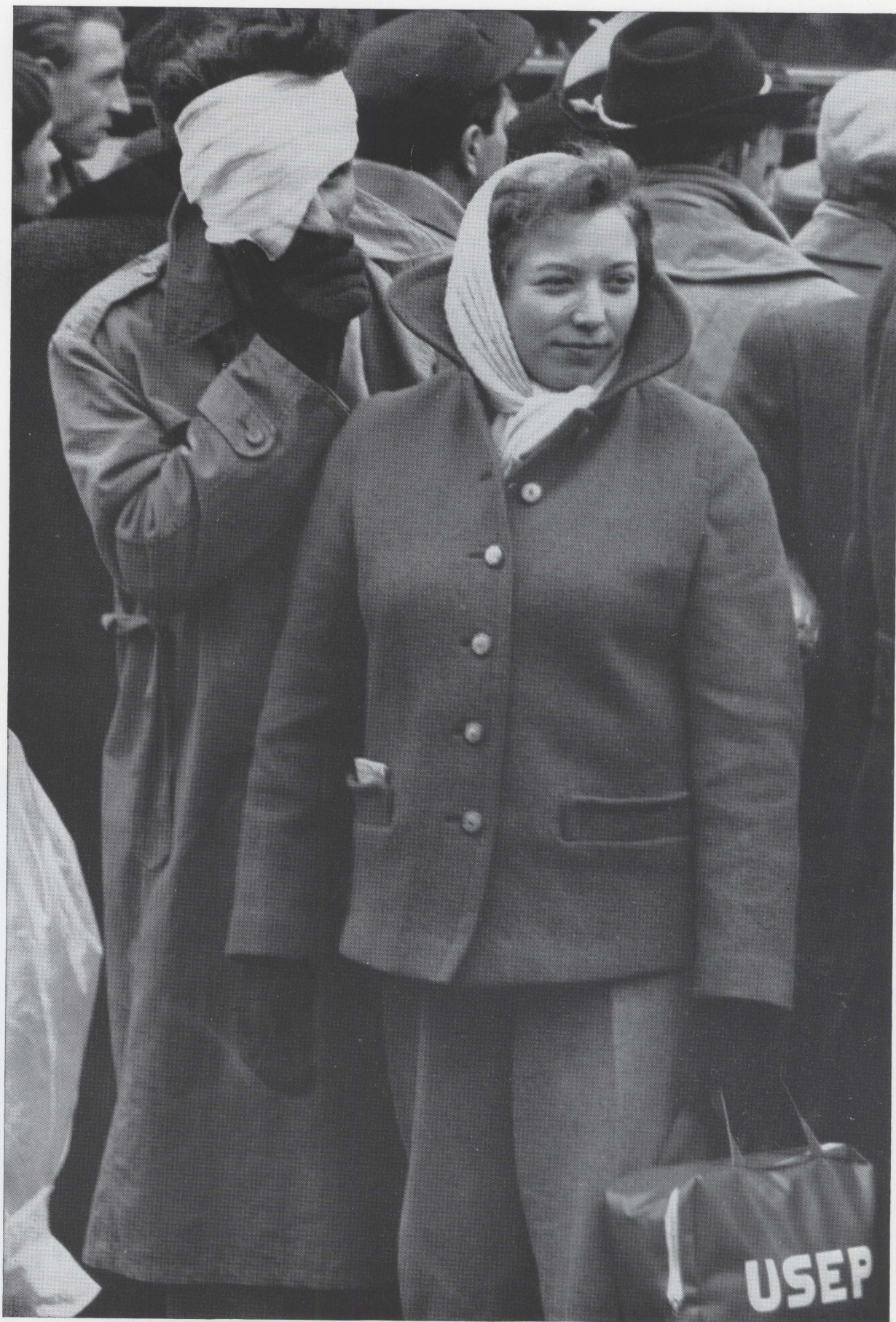
A wounded freedom fighter and his lady.