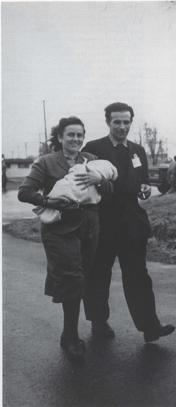
Only a few long days after their escape from Hungary, this couple strolled happily with their baby at Camp Kilmer. Now a new life is beginning for them.

For weeks these men, women, and children had been keyed up to two of man's most gripping emotions, war and flight. By the time they reached McGuire, the independence which had spurred them on during Hungary's explosive drama had been replaced by the knowledge that while they now had freedom, they also were faced by complete insecurity in an alien land with an alien tongue. Getting off the airplanes, they obediently followed directions to the letter and almost scrupulously avoided any signs of individualism. Indeed, now, in many ways it was hard to visualize these people opposing the vaunted Russian legions and armor.