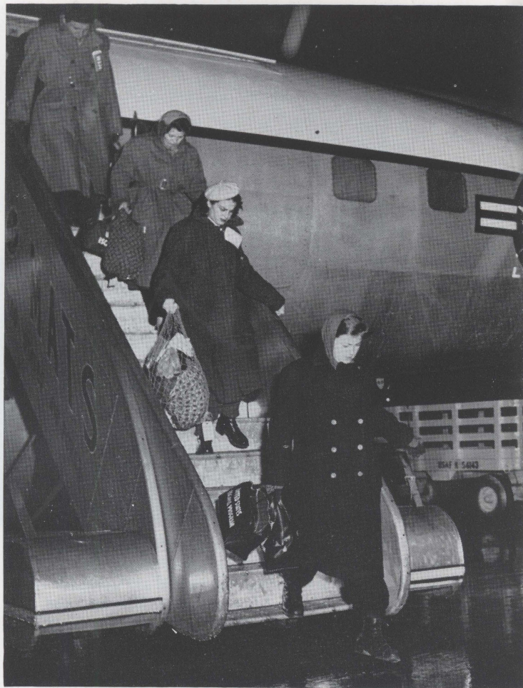
The long flight to freedom ended, and passengers took their first step in America.