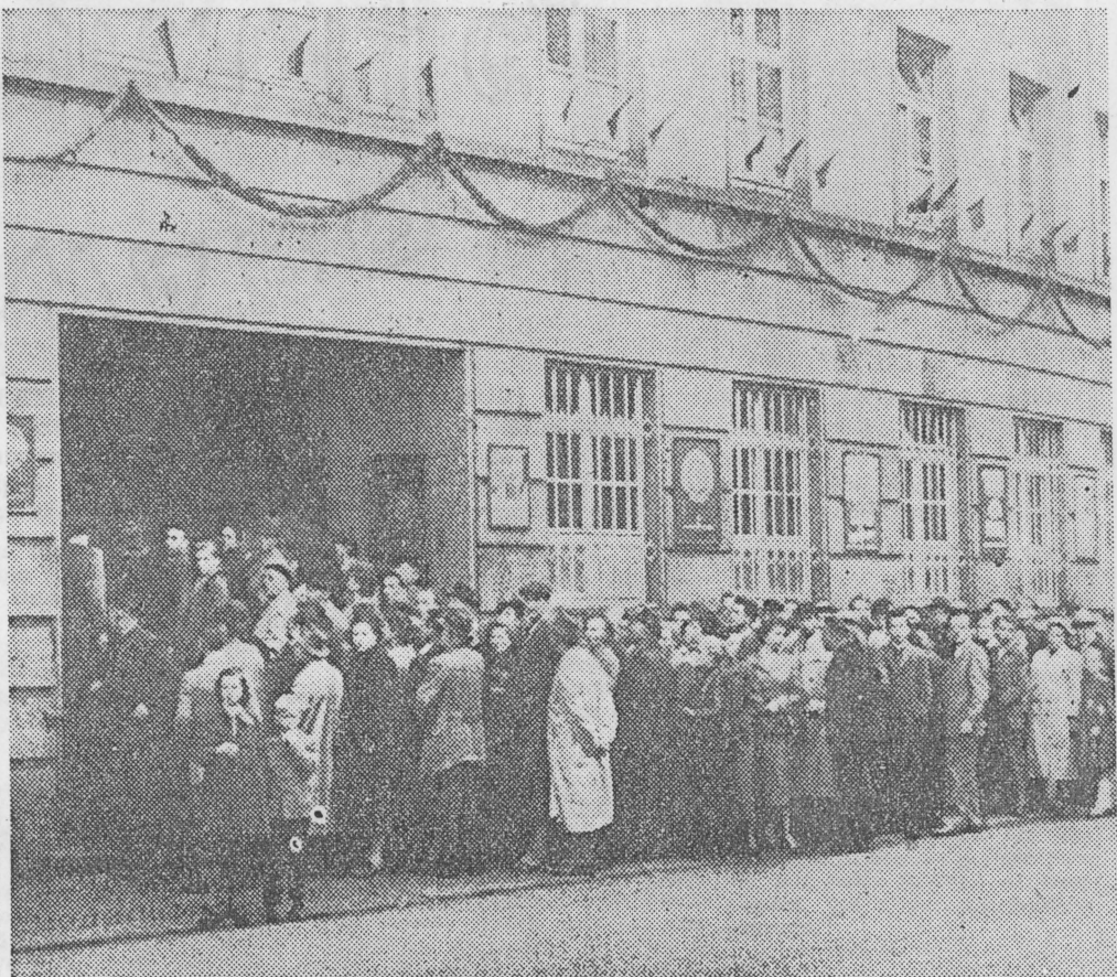
GERMAN REDS VOID OLD CURRENCY: Residents crowded the conversion centers in East Berlin last week to turn in East marks and obtain new currency. The shift was announced on Sunday, Oct. 13, without prior notice, by Premier Otto Grotewohl. Action wiped out East German money held in West Berlin, said to be more than $825,000.

"Civilized mankind must never forget and never forgive the