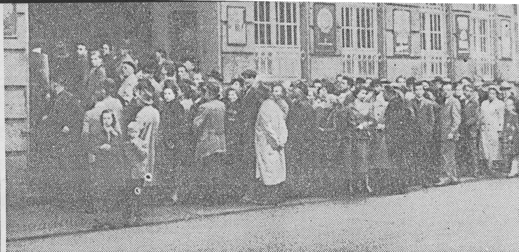
GERMAN REDS VOID OLD CURRENCY: Residents crowded the conversion centers in East Berlin last week to turn in East marks and obtain new currency. The shift was announced on Sunday, Oct. 13, without prior notice, by Premier Otto Grotewohl. Action wiped out East German money held in West Berlin, said to be more than $825,000.

tions funds to care for Hungarian refugees. He added that the United States should permit more Hungarian refugees to enter and should make work available to them.