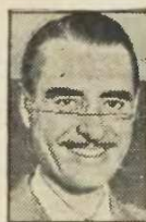
The late John Gilbert

King Features Syndicate, Inc. HOLLYWOOD—Now that Jack Gilbert is dead, Hollywood is recalling a lot of nice things about this colorful but