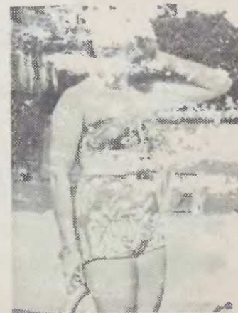
SECRET'S OUT. — Audrey Meadows, of television's eye-filling Meadows sisters, has replaced sister Jayne as a panelist on CBS Television's "I've Got a Secret." Jeane leaves for starring role on Broadway "Lunatics and Lovers."