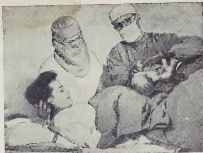
BLESSED EVENT on "The Search."—This mother's smile is the result of having been conscious all through the natural childbirth of her 8 lb., 3 oz., daughter at Grace-New Haven (Conn.) Community Hospital. The scene is from the childbirth sequence in CBS Television's "The Search" program of Dec. 5, based on the work of Yale University's Child Study Center.