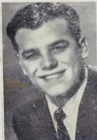
MORNING STAR. Julius La Rosa will be Jack Paar's special guest star on "The Morning Show" over CBS Television for two weeks.