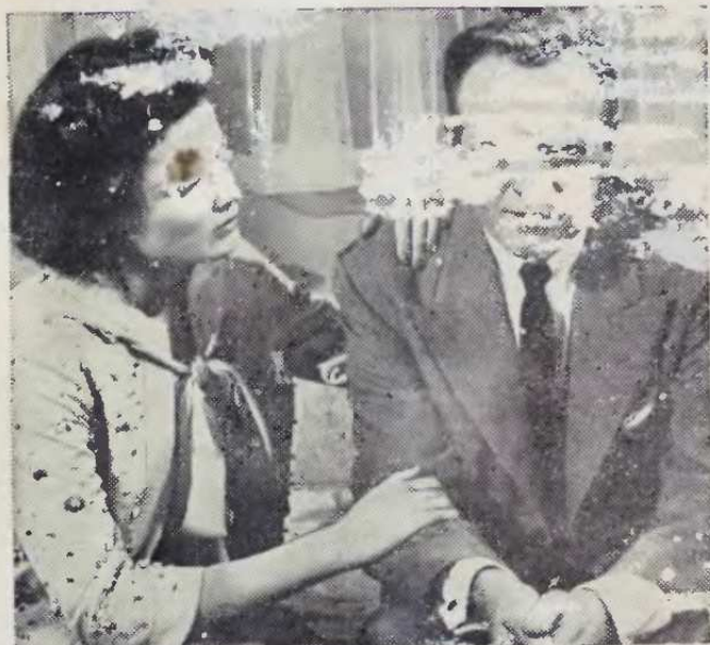
VAN HEFLIN, Gene Tierney in one of many suspenseful scenes of "Black Widow", now at The Garden Theatre