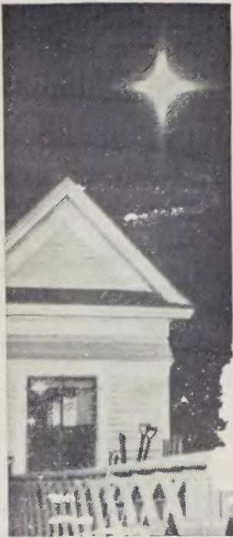
CITY DESK of the Milwaukee Sentinel receives a flood of calls when the low-hanging, bright moon looked like this