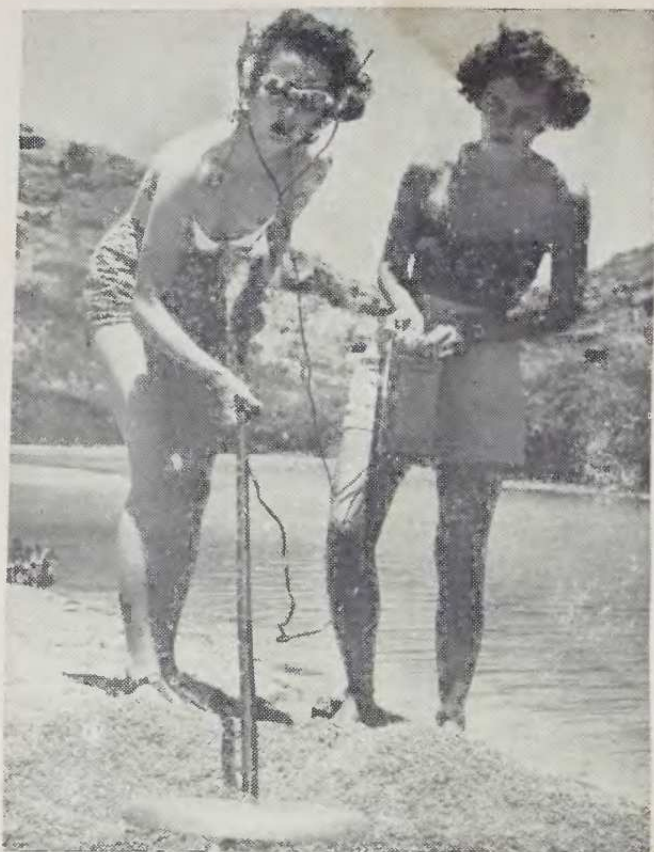
THESE VACATIONERS are trying to pick up some extra money for trip by hunting for buried treasure near Guaymas, Sonora. They're using special mine detector.