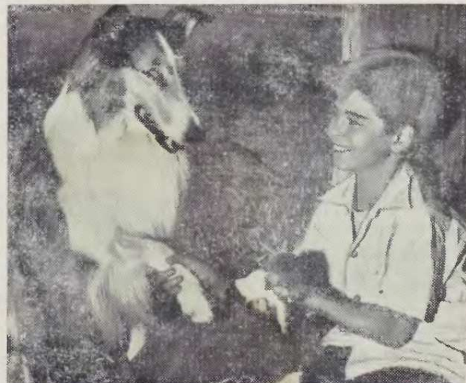
PUPPY LOVE —Tommy Rettig, star of the "Lassie" series on the CBS Television Network, holds one of the 10 collie puppies from the Lassie Kennel that will be given away as prizes in a nationwide Name-the-Pups contest, as the canine star of the Sunday evening series looks on approvingly.

Cartoon animation — how drawing board characters are brought to life — will be seen in "A Story of Dogs," Walt Disney's full-hour DISNEYLAND feature on ABC-TV Wednesday, Dec. 1, along with the rib-tickling adventures of the celebrated and Plucky. The time: 7:30 to 8:30 p.m., EST. Channel 13 at 7:30 p.m. Wednesday, Dec. 1, N. J. CHAMBER OF COMMERCE DINNER with Dr. George Kung Chao Yeh, chairman of the Chinese Delegation to the U.N. and Nationalist China's foreign minister. Chao's topic will be: "A Free and Independent China." On Sunday, Nov. 28, at 9:00 p.m. THE GENERAL ELECTRIC THEATER. A young girl goes out in search of Mr. Death in an effort to dissuade him from taking her sweetheart. Instead of succeeding in her mission, she finds that she herself has fallen in love with him. For the second season, Coca Cola will present "SANTA CLAUS AT MACY'S" six days per week over the Du Mont Television Network, beginning Wednesday, December 1, and continuing until Friday, December 24.