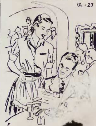
She Was A Part-T