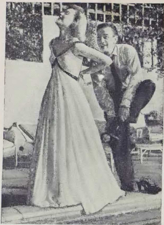
"PHILADELPHIA STORY" — Dorothy McGuire stars as Tracy Lord and Richard Carlson plays newspaperman Mike Connor in "The Best of Broadway" color production of Philip Barry's three-act comedy, "The Philadelphia Story," Wednesday, Dec. 8, on the CBS Television Network. Co-starred with them are John Payne, Herbert Marshall, Mary Astor, Charles Winninger and Dick Foran.