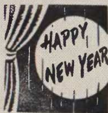
WHITE and SHAUGER, Inc.