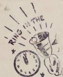
Mr. & Mrs.