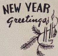
JOHN G. KOTRAN FUNERAL HOME