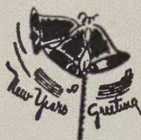
New Italian Kitchen

REAL ESTATE — INSURANCE 356 Totowa Ave. Paterson Lambert 3-2083