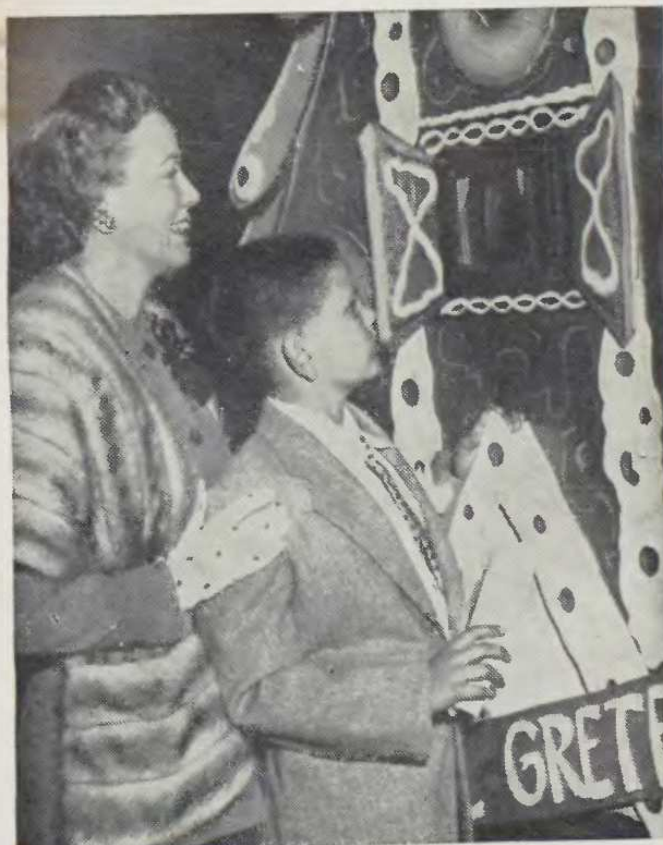
MOST PREMIERES in Hollywood are klieg-lighted ones held for grownups, but some youngsters got a chance to attend theirs when they saw a Walt Disney movie. Former star Eleanor Powell and son admire a cookie house.