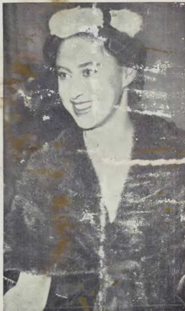
PRINCESS MARGARET , a model of fashion herself, seems to be enjoying the collection of Christian Dior fashions in Blenheim palace in London. The Duke of Marlborough offered the use of the palace for the fashion show.