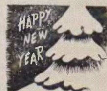
TOM BRINO Music Studios