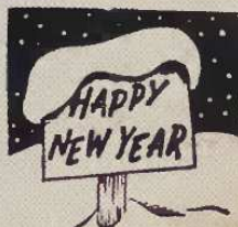
CHIRP and NICK CHIRCHELLA'S CIRCLE RESTAURANT