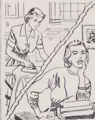
The Homemaker Took a Job; The Career Girl Kept House