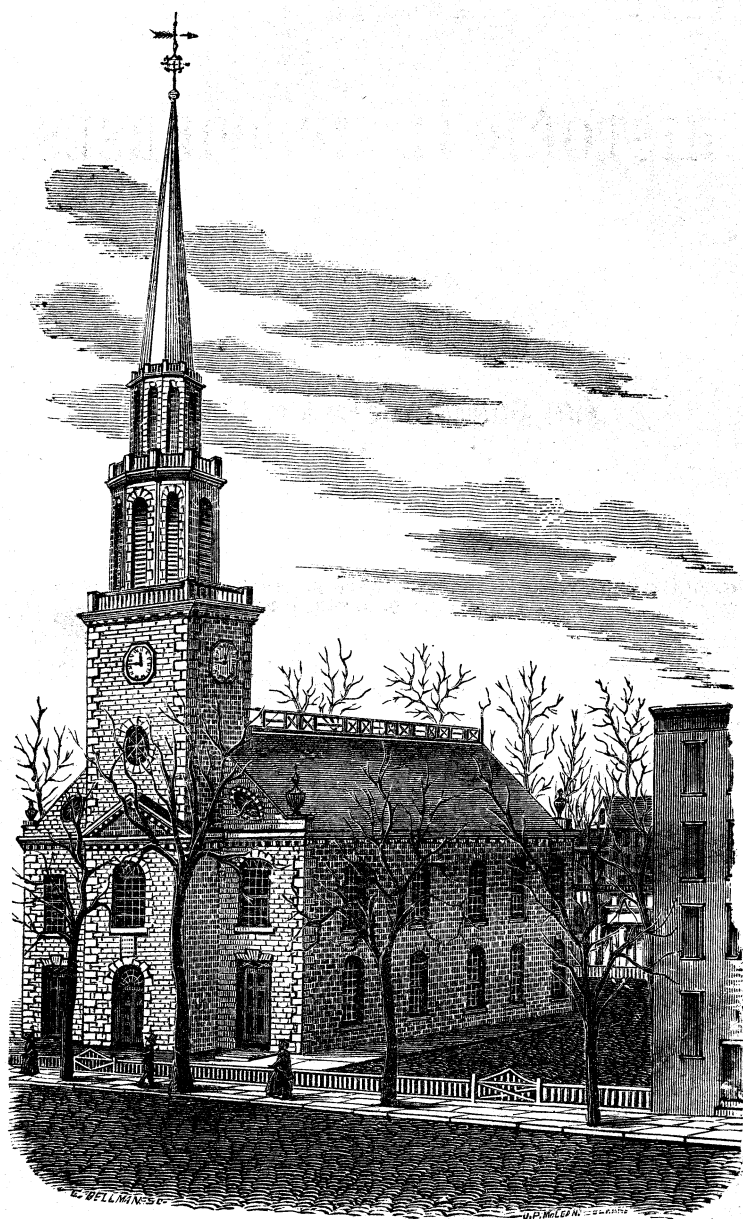
First Presbyterian Church, Newark, N. J.

Corner-stone laid, Sept. 1787. Opened for worship, Jan. 1, 1791.