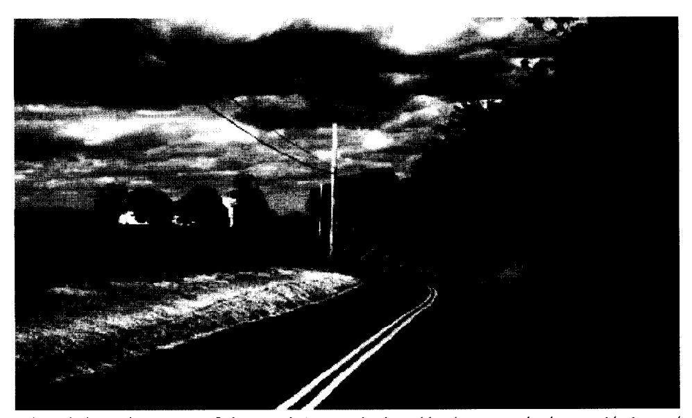
Through the implementation of alternate design standards and land use controls, the overwidening and straightening of this road was kept to a minimum and edge treatments of this road were softened allowing the environment to be enhanced and protected for the pleasure of driving, biking, or walking now and into the future.