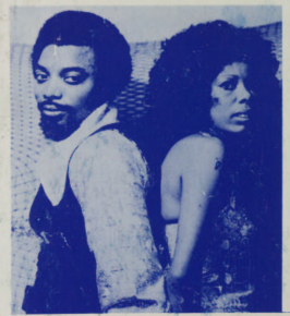
GABRIEL'S HORN AND SANDY

STRUMMIN' AND STRUTTIN' FAMILIAR MELODIES IN A WARM AND FRIENDLY STYLE.