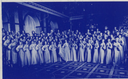
THE RAMAPO VALLEY CHAPTER OF THE SWEET ADALINES

OUTSTANDING NEW JERSEY ENTERTAINERS IN THE COUNTRY TRADITION.