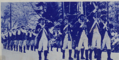
NEW JERSEY COLONIAL MILITIA ANCIENT FIFE AND DRUM CORPS

10:00 A.M. TO 2:00 P.M. CONTINUOUS ACTIVITIES ON THE ARTS CENTER MALL & PLAZA