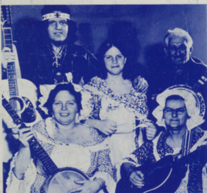
THE PINE CONERS

OUTSTANDING NEW JERSEY ENTERTAINERS IN THE COUNTRY TRADITION.