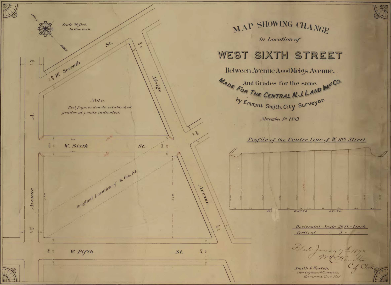
Profile of the Centre line of W. 6 th Street.

Note. Red figures denote established grades at points indicated.