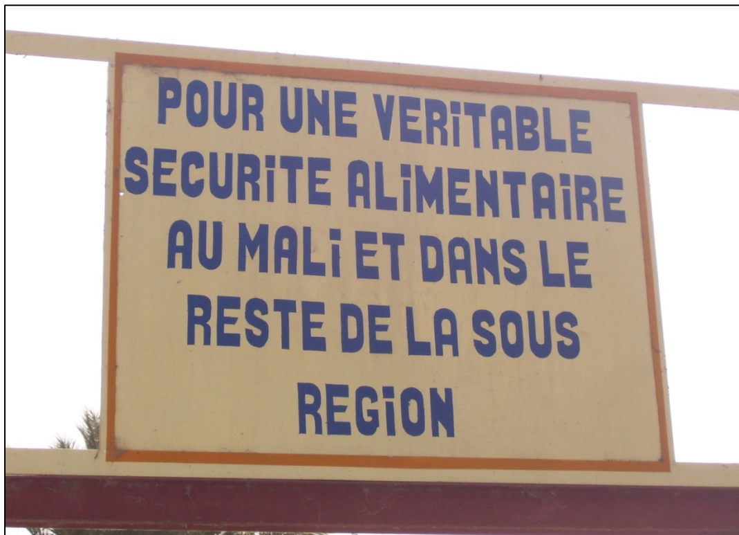
Fig. 2 Motto of the Molodo Zone. Photo by author April 2010

administration. 1005 The staff members at Molodo no doubt believe that they have a real role in realizing this goal for the Office in Mali. However, this slogan was a visceral and hard-fought reality among Office men and women in the 1970s and 1980s when they supported thousands of hunger migrants, as well as their own households, from their meager ration and illicitly obtained rice. Office farmers who remember the 1940s also saw themselves fulfilling this role for their neighbors--those hit by poor millet harvests--when selling rice without official permission. This local food security in rice was assured through men's and women's labor. Women at the Office in particular made sure that food security extended beyond the provision of rice to include diverse and nutritious ingredients, familiar textures, and enticing smells in the daily meals that they prepared.