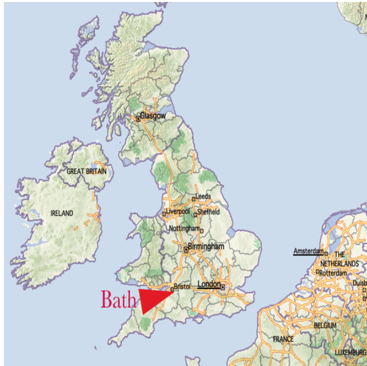
Figure 1: Map of Bath

Historic preservation plays a key role in defining a nation's legacy as exemplified by its past triumphs. With the increasing presence of economic and social issues affecting future generations, problems concerning historic preservation nonetheless erupt for buildings and the valuable history they offer both a city