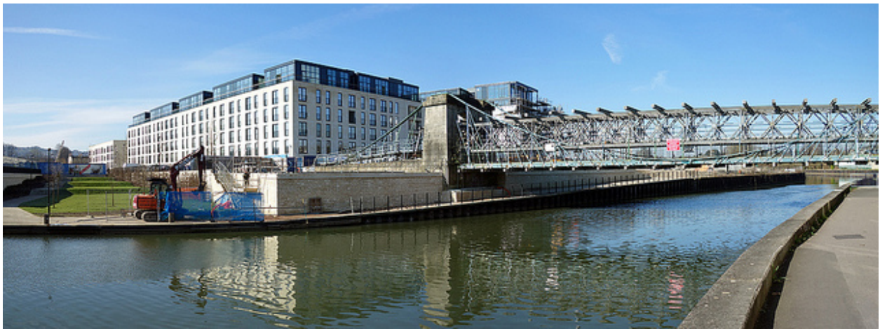
Figure 5: Western Riverside Development In Progress 75

development have risen and are more pressing than the unchanging existence of SouthGate. These complications pose a considerable threat to Bath's future as this development has the potential to become Bath's second SouthGate. This matter will be discussed in further detail in relationship to UNESCO's most recent area of concern for the city's safety.