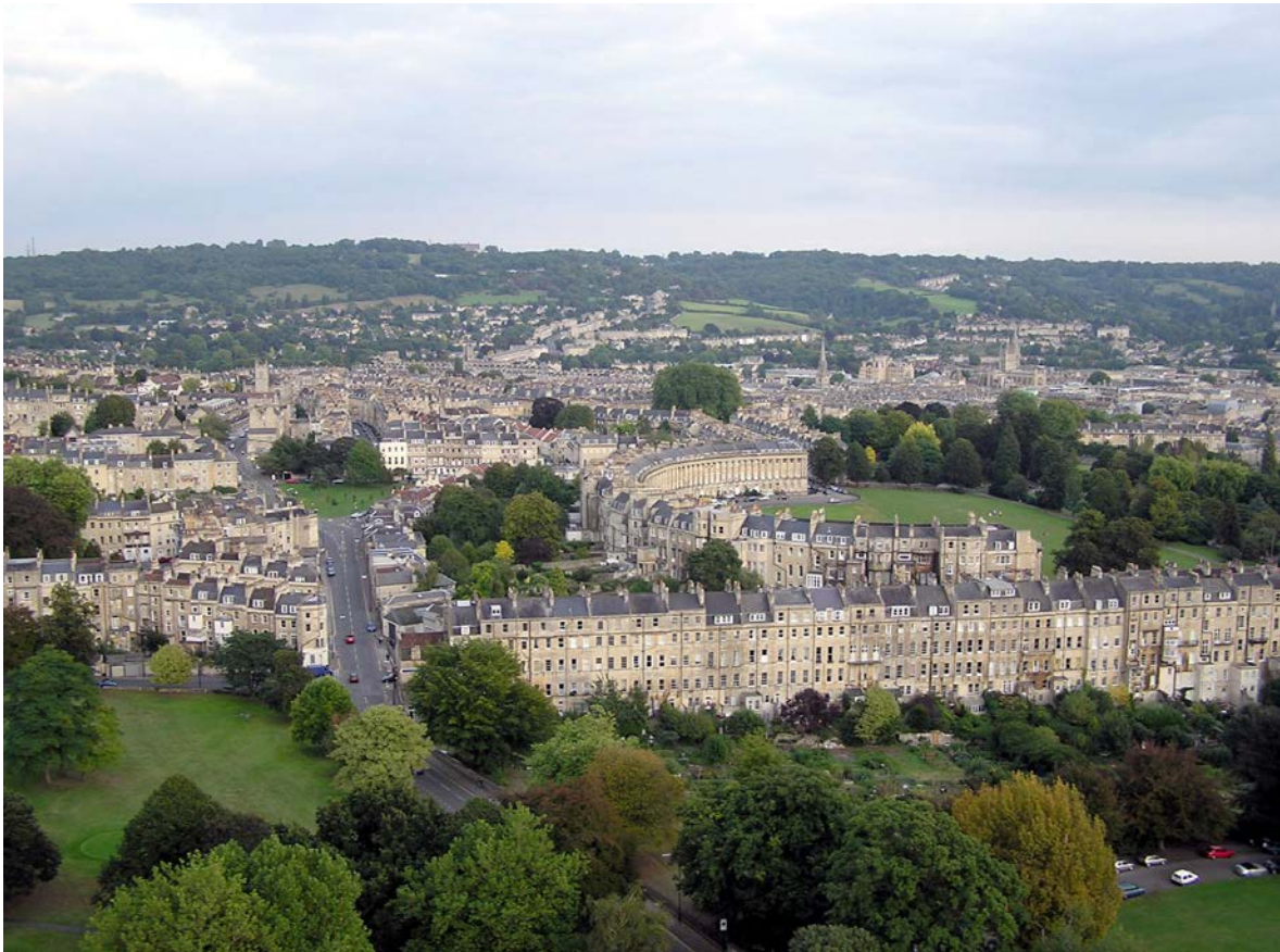
Figure 3: An Aerial View of Georgian Bath, Focusing on the Royal Crescent 55