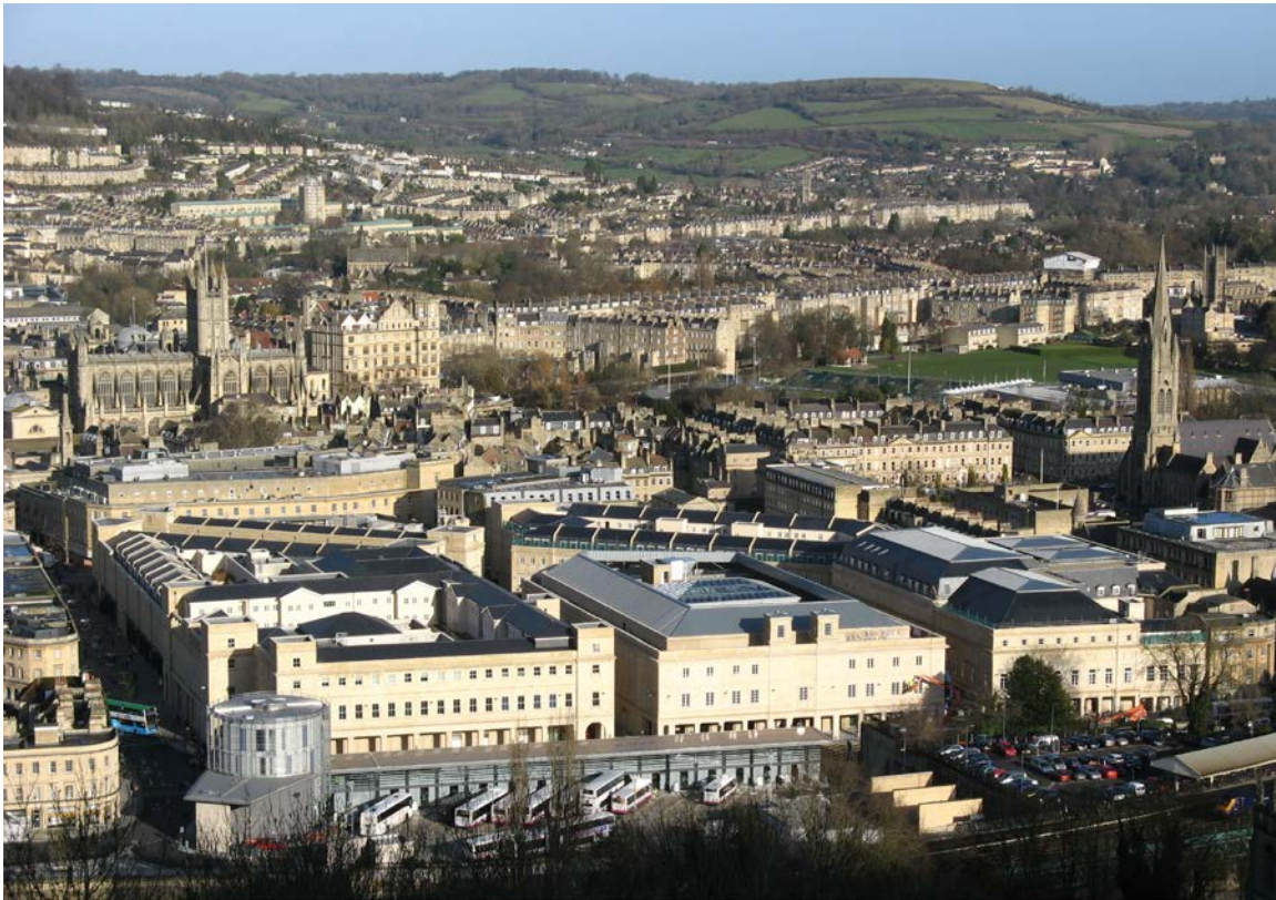
Figure 4: View of SouthGate Bath from Beechen Cliffs 71

Bath's buildings. 70 Hopefully, the Watchdog, in collaboration with the Trust, will be able to enact a better level of change that will ensure Bath's ability to remain a World Heritage City for another twenty-five years, or longer. This may be possible, provided that no new developments arise in the near future to complicate this situation.