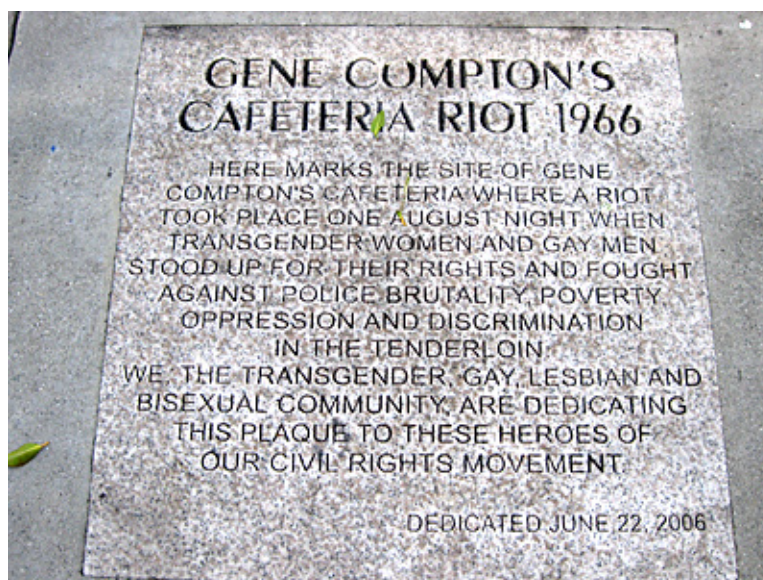
Figure 9: 46 th Anniversary Plaque at the site of the Compton's Cafeteria Riot from 46th Anniversary of Compton's Cafeteria Riots

receive such a plaque was the site of the 1966 Compton's Cafeteria riots. The plaque was placed at the corner of Turk and Taylor Streets.