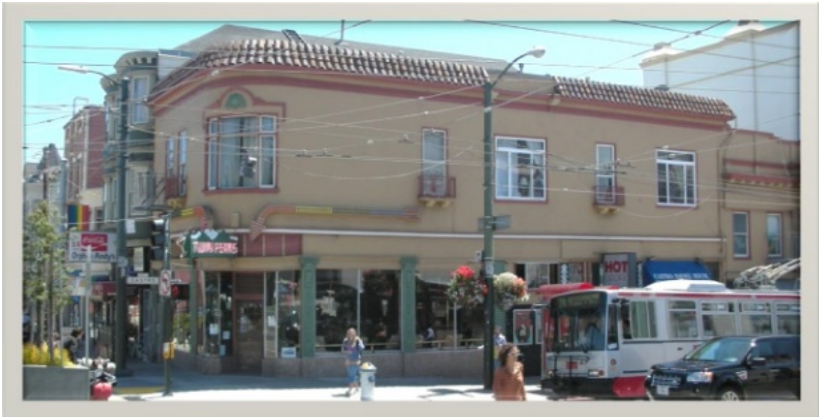
Figure 7: Twin Peaks Tavern, from San Francisco Planning Commission Landmark Designation Report (September 24, 2012) http://www.sf-planning.org/ftp/files/Preservation/landmarks_designation/Adopted_TwinPeaksLM_Report.pdf

landmarks. Engaging and educating the public on the process of historic preservation creates more community support for landmark designation. Engaged members of the public also provide preservationists with more sources and information via oral histories collected for the landmark nomination of the Twin Peaks Tavern.