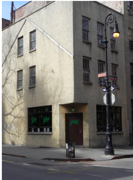
Figure 3: Julius' Bar, Greenwich Village Photographed by Catherine Aust, March 1, 2014

in New York (and the oldest bar in Greenwich Village, according to Julius' website), as well as the site of the 1966 "Sip-In" that resulted in the end of New York State's prohibition on serving alcohol to individuals known to be homosexual. 56