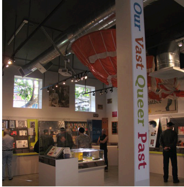
Figure 10: Main Gallery of GLBT History Museum