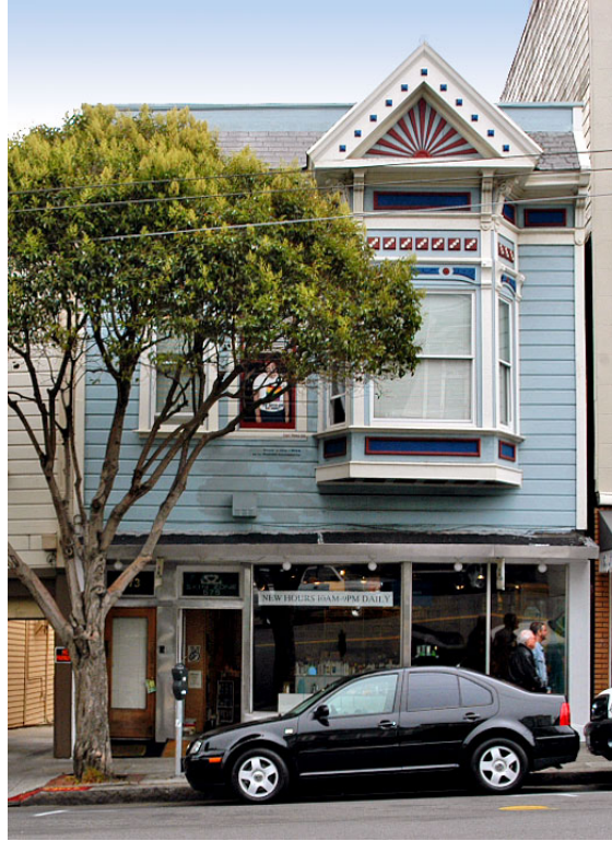
Figure 6: Castro Camera and Harvey Milk Residence, from NoeHill SF Landmark Information Page (May 29, 2003) http://www.noehill.com/sf/landmarks/sf227.asp