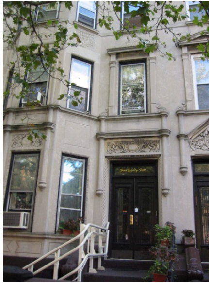
Figure 4 Lesbian Herstory Archives From LHA Website, Picture dated September 1, 2005 http://www.lesbianherstoryarchives.org/tourintro.html