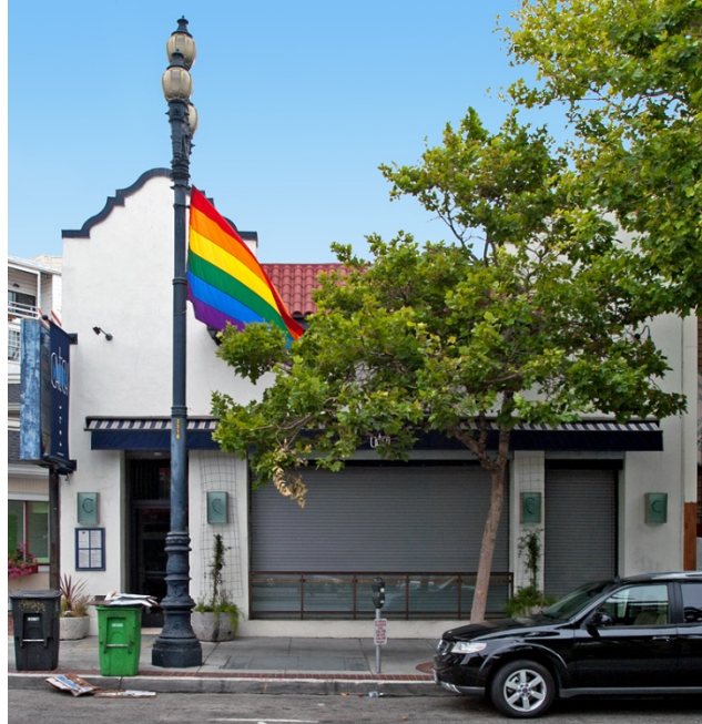
Figure 8: Jose Theater / NAMES Project from NoeHill SF Landmark Information Page (June 14, 2008) http://www.noehill.com/sf/landmarks/sf241.asp