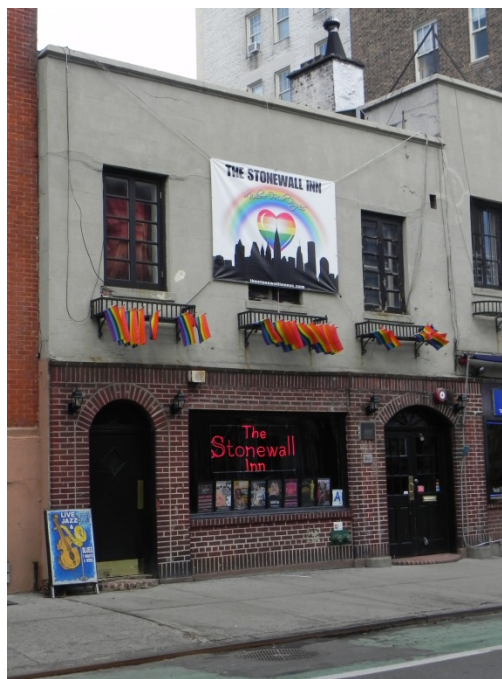
Figure 11: The Stonewall Inn March 1, 2014

Additionally, the NHL includes not only the area of the original Stonewall Inn, but also Christopher Park. According to the nomination, the park still retains its 1969 boundaries, and includes the 1936 statue of Philip Henry Sheridan and the 1992 George Segal sculpture, Gay Liberation .