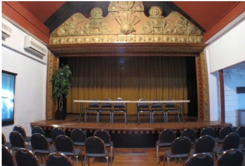
Figure 13: Interior of the Cherry Grove Community House & Theater from National Register of Historic Places Registration Form (April 26, 2013) http://www.nps.gov/history/nr/feature/places/pdfs/13000373.pdf