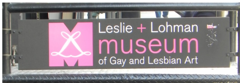
Figure 5 Minimal signage for the Leslie Lohman Museum of Gay and Lesbian Art Photographed by Catherine Aust, March 1, 2014

The museum currently provides visitors with six to eight major exhibitions a year, as well as talks, discussions, and film screenings, among other LGBTQ culturally-educational events. The museum asks that visitors only donate what they wish in place of an admission fee. The museum is home to over 50,000 works, information on over 3,000 LGBTQ artists, and a library with over 2,000 volumes of publications on LGBTQ art. The museum also publishes a quarterly LGBTQ art journal called The Archive : once again, a non-profit organization has taken on the responsibility to display and preserve cultural heritage of a minority group that is not represented in city, state, or national museums. Places like the Leslie Lohman Museum are paving the way for a national LGBTQ museum and should be formally recognized by their cities and states for their successes.