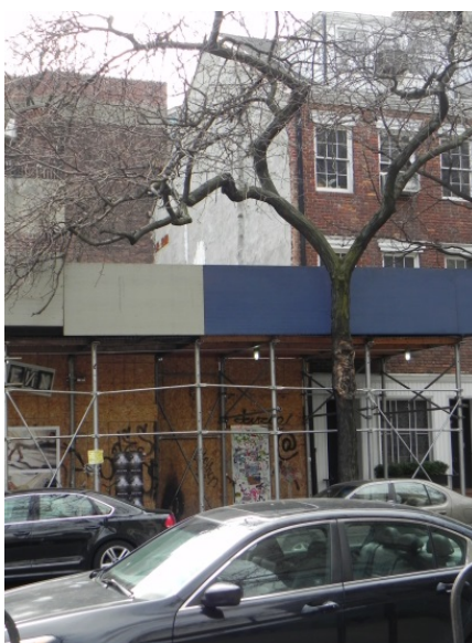
Figure 2: 186 Spring Street (vacant lot) Photographed by Catherine Aust, March 1, 2014

1824 row house at 186 Spring Street. 51 For example, a GVSPH blog post from June 19, 2013 compares the landmark designation of the Louis Armstrong House in Queens: despite having been significantly more altered from its original form than that of 186 Spring Street, the LPC determined the Louis Armstrong House had retained its historic significance, unlike 186 Spring Street. 52 After years of proposals, the second phase of the South Village expansion was approved by the LPC as a historic district in December 2013. The third phase's designation is still not landmarked, although it is still being considered by the LPC. 53