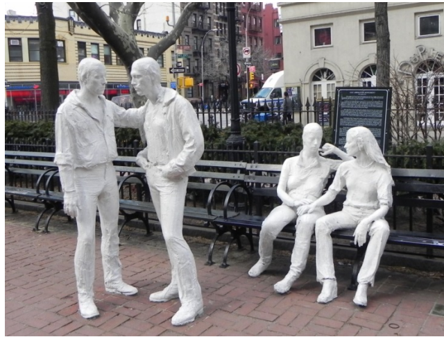
Figure 1: George Segal's Gay Liberation Monument in Christopher Park Photographed by Catherine Aust, March 1, 2014

the already limited area. Following the sculpture's unveiling in 1992, LGBTQ complaints mentioned that not enough people were consulted in the design of the sculpture, that the four figures were cast in a white patina, and that Segal himself identified as heterosexual so the commission should have gone to a LGBTQ artist. 49