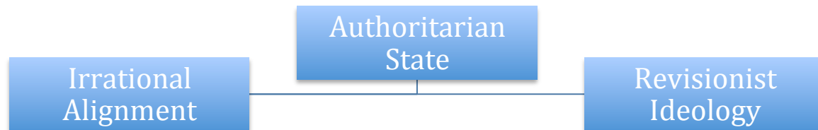
Figure 2. Alternative Hypothesis 1 for Alignment Determinants in Syria

The first alternative hypothesis states that authoritarian states do not have a rational foreign policy, one that is capable of maximizing utility and minimizing costs, due subordinating foreign policy for regime survival. To compensate for lack of legitimacy domestically, authoritarian rulers utilize foreign policy as a focal point to divert the public's attention from internal economic, social and political crisis. Hence foreign policy does not serve national interests, and is then by definition irrational. This hypothesis focuses on ideology as the motivator for foreign policy in authoritarian states.