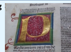
Illuminated Preaching Manual from the Capuchin Monastery Archives and Library