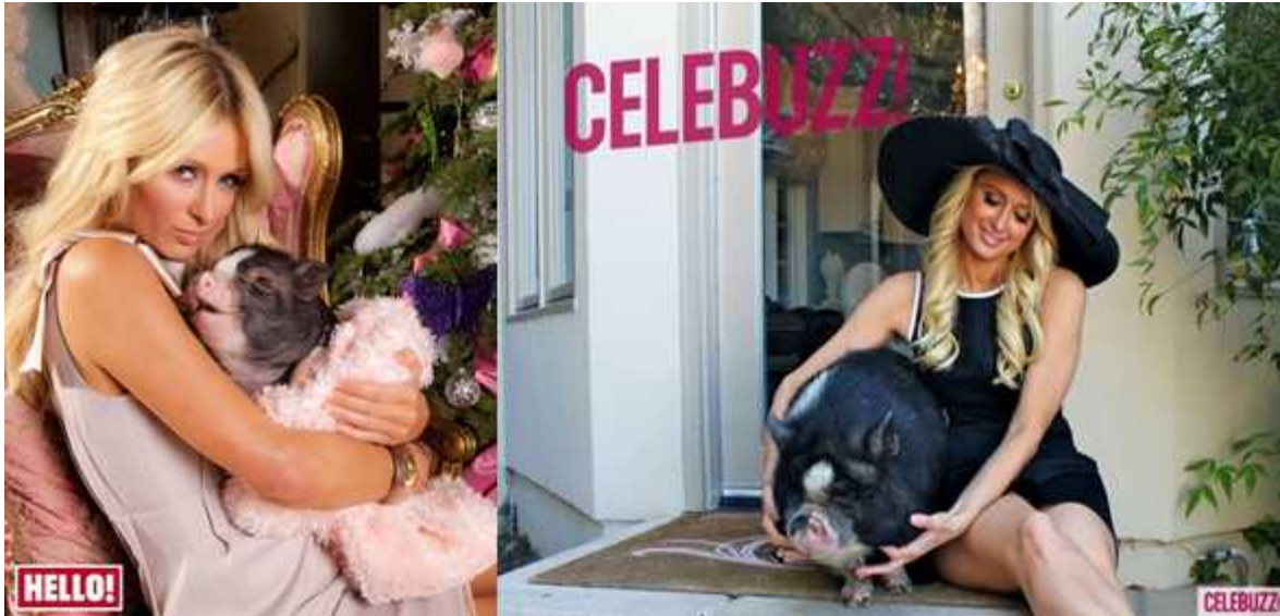
Figure 1- Paris Hilton's Mini Pig in 2010 (left) and 2011 (right)