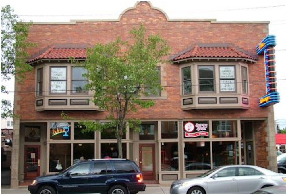
Brothers Lounge present day