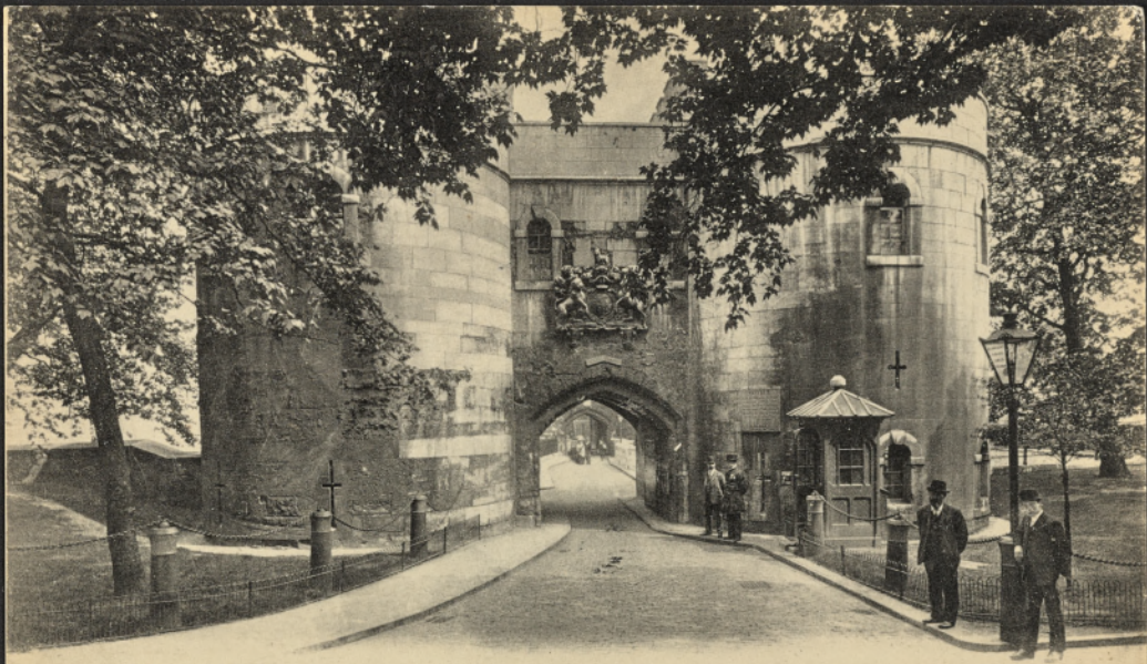
306 THE TOWER OF LONDON. — The Middle Tower. — LL.