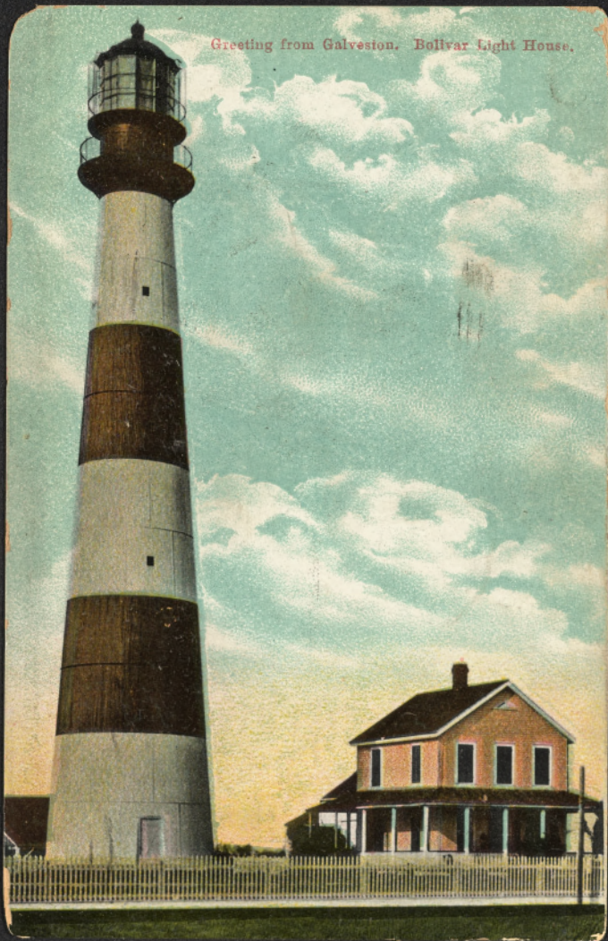
Greeting from Galveston. Bollivar Light House.