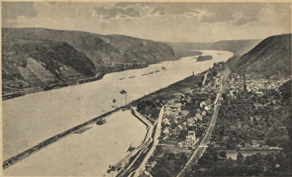
Blick von Schloß Rheineck rheinaufwärts auf Broll.