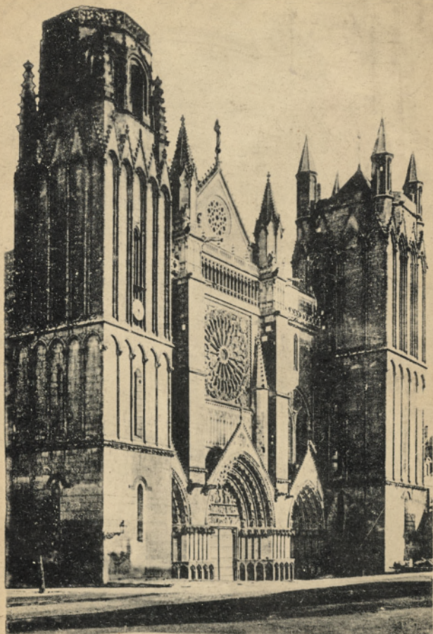
POITIERS (Vienne) - La Cathédrale St-Pierre (XII e , XIII e et XIV e siècles) Façade principale Ouest