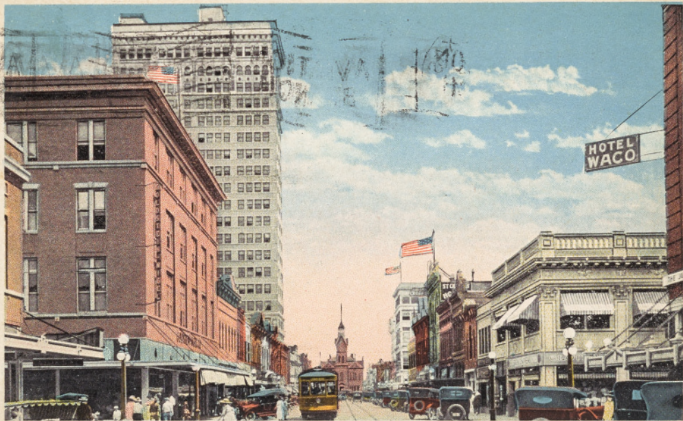
AUSTIN STREET, LOOKING EAST FROM SIXTH STREET, WACO, TEXAS.