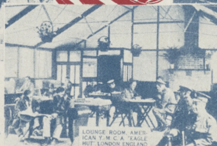
LOUNGE ROOM, AMERICAN Y.M.C.A. 'EAGLE' HUT, LONDON, ENGLAND