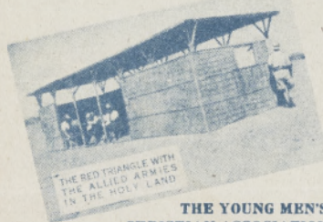
THE YOUNG MEN'S CHRISTIAN ASSOCIATION "Over There"