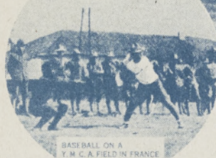
BASEBALL ON A Y.M.C.A. FIELD IN FRANCE