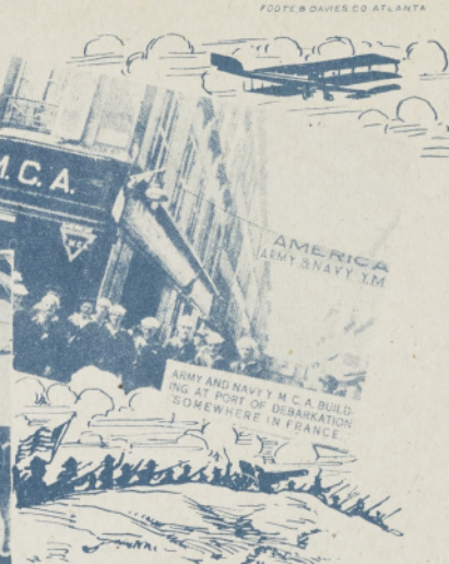
AMERICAN ARMY AND NAVY Y.M.C.A. BUILDING AT PORT OF DEBARKATION SOMEWHERE IN FRANCE