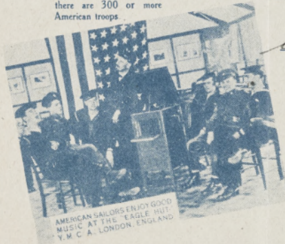
AMERICAN SAILORS ENJOY GOOD MUSIC AT THE 'EAGLE' HUT, Y.M.C.A., LONDON, ENGLAND