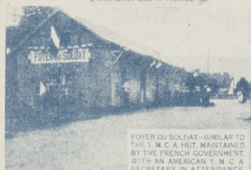
FOYER DU SOLDAT—SIMILAR TO THE Y.M.C.A. HUT, MAINTAINED BY THE FRENCH GOVERNMENT WITH AN AMERICAN Y.M.C.A. SECRETARY IN ATTENDANCE