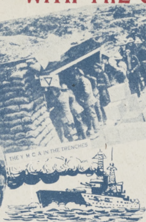
THEY M.C.A. IN THE TRENCHES