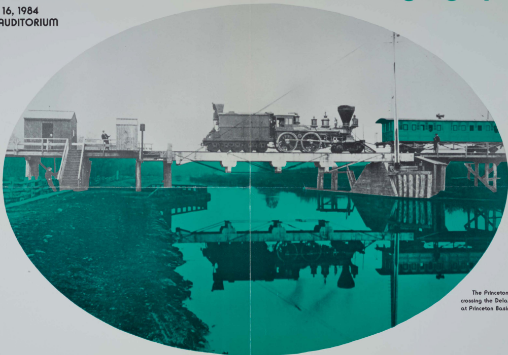
The Princeton Branch Shuttle Railroad crossing the Delaware and Raritan Canal at Princeton Basin (c. 1860).

SATURDAY, JUNE 16, 1984 STATE MUSEUM AUDITORIUM TRENTON