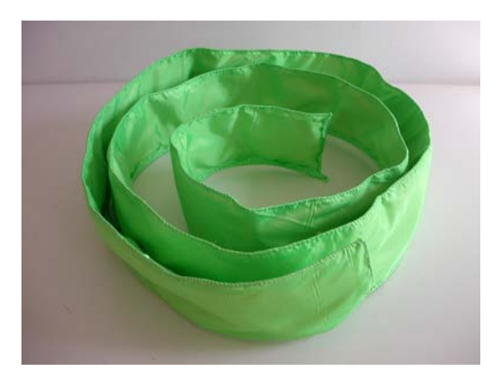
Small Landscape , 2007 canvas, cloth, thread & stuffing 16 x 25 x 6 inches