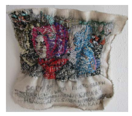
Freedom 1 , 2010 canvas, thread & stuffing 7 x 7 inches