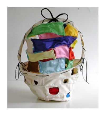
Girl , 2009 canvas, cloth, wire, thread, & ribbon 22 x 18 x 16 inches