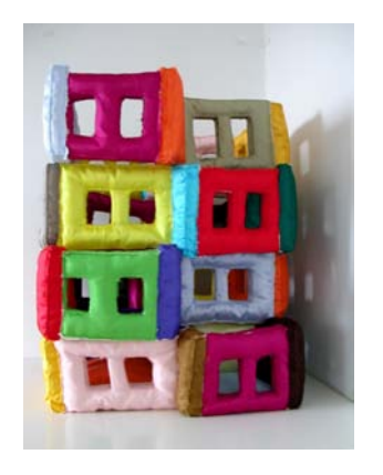
Spring 2 , 2007 canvas & cloth 25 x 22 x 23 inches