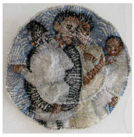
The Obama Family , 2008 thread on canvas 7 x 7 inches