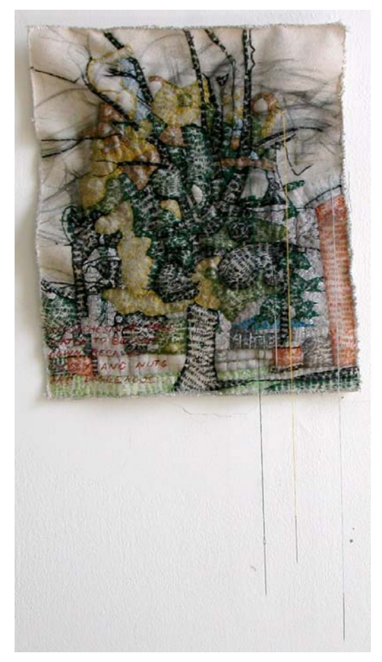
Slated To Be Cut , 2008 thread on canvas with needles 20.5 x 10.5 inches