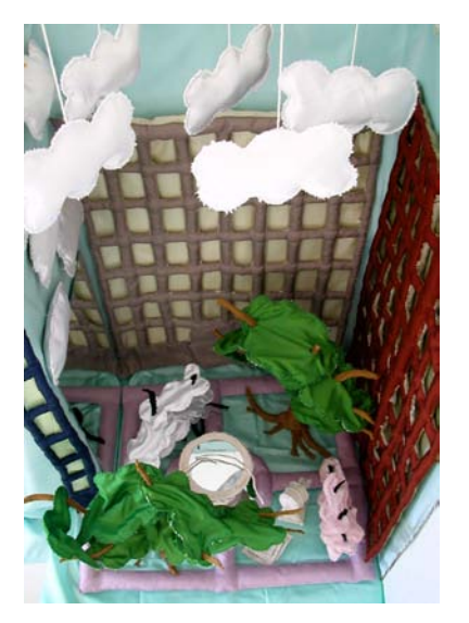
Spring 1 , 2007 canvas, cloth, thread, wire & yarn 42 x 46 x 22 inches