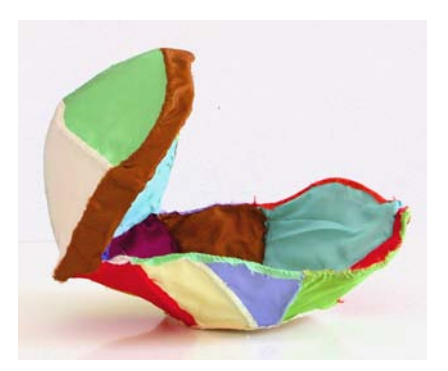
Cradle , 2009 canvas, cloth, wire & thread 11 x 15 x 9.5 inches

Green Landscape , 2010 canvas, cloth, wire & thread 18 x 19.5 x 20 inches