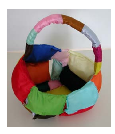
Basket 1 , 2007 canvas, thread, cloth & wire 20 x 17 x 13 inches