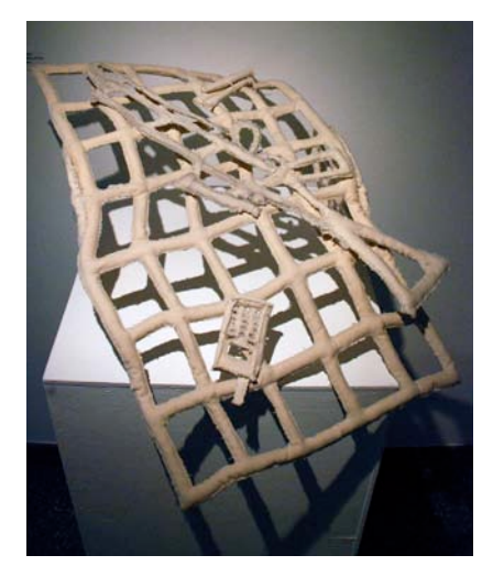
Weapons of War , 2005 canvas, thread, stuffing, & wire 20 x 27.5 x 13 inches

No Health Care for Illegal Immigrants , 2009 canvas, wire & thread 14 x 16 x 9 inches