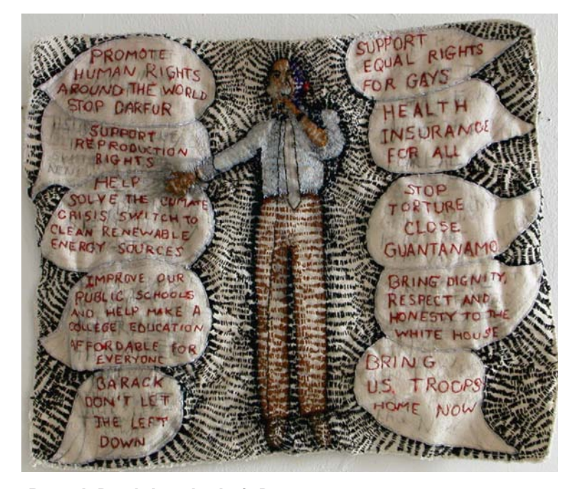
Barack Don't Let the Left Down , 2008 thread on canvas 12 x 15 inches