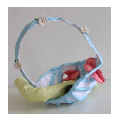
Wedding Basket , 2008 cloth, canvas, thread, stuffing & wire 13.5 x 17 x 13 inches