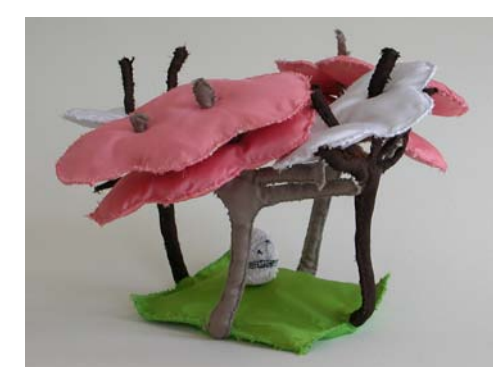
Landscape with Skull , 2008 canvas, cloth, wire & thread 10 x 10 x 6 inches