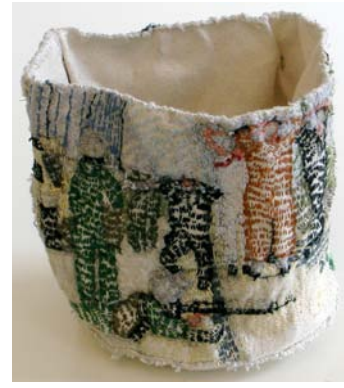
Iraq-Afghanistan-Iraq , 2009 canvas, thread & stuffing 5 x 5 x 4 inches