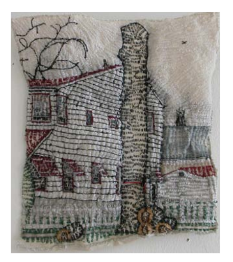
Lyndhurst Landscape , 2009 thread on canvas 10 x 9 inches

Why? , 2005 canvas, thread, & stuffing 37 x 29 x 18 inches; 6 panels