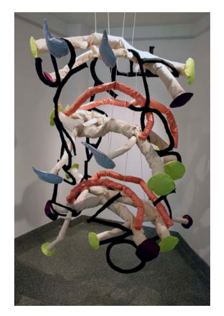
Hanging up Support for a Public Option , 2010 canvas, thread, wire, stuffing, cloth & yarn 51 x 36 x 31 inches