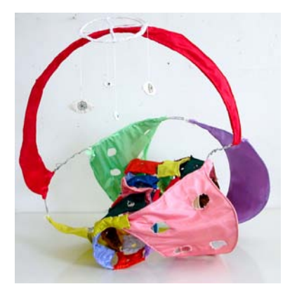
Seeing it Through, 2009 canvas, cloth, stuffing, wire, & thread 28 x 28 x 24 inches