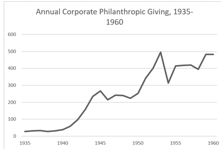
Table Bg676-690 - Corporate charitable and philanthropic giving, by sector, and large corporate foundation assets: 1929–1997 Historical Statistics of the United States Millennial Edition